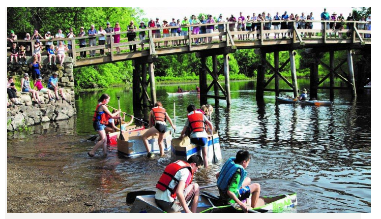
Don't miss the celebration...

SAVE THE DATE FOR RIVERFEST 2019! JUNE 22 & 23, 2019