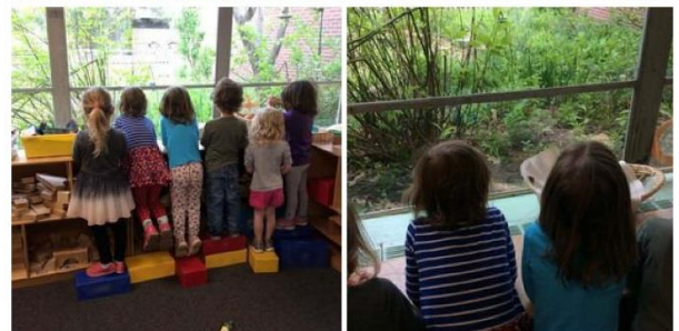
Areas of learning taking place:

NAEYC: 3.A Enriched Learning Environments, 3.F Making Learning Meaningful, 2.D Language, 3.E Children's Interest & Needs, 2.B Social-Emotional, 1.D Harmonious Classroom, 2.C Physical, 3.B Caring Communities, 3.G Deepen Understanding, 9.D Environmental Health,