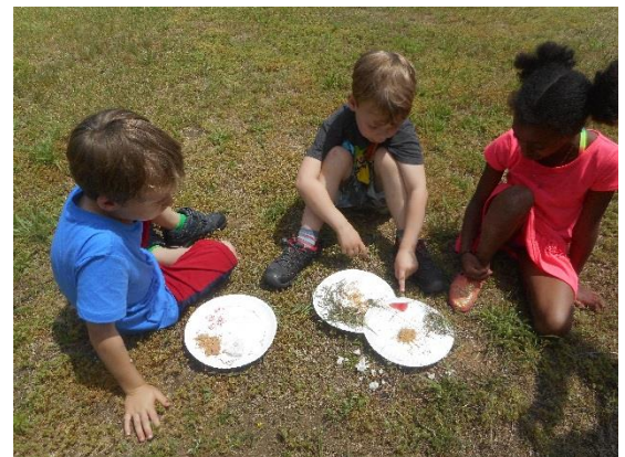
Studying the food preferences of ants on the playground