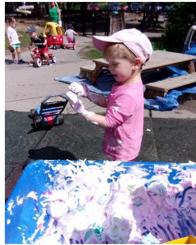
The joy of water and shave cream