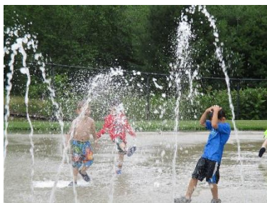
Splash Pad at Thoreau

Outdoor play is a key component of the summer at CCC