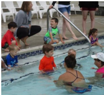
CCC Teachers by the side of the pool