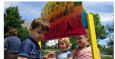
The older children made fresh lemonade and created a business!

Wishing all our families a relaxing and fun summer