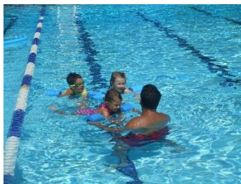
Thoreau instructors in the pool