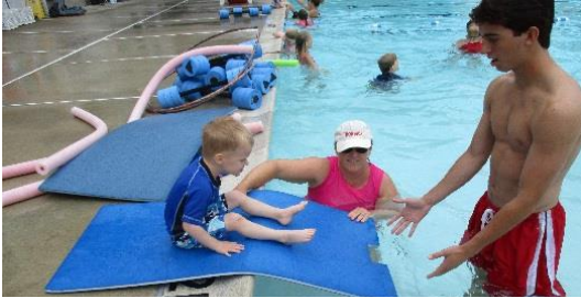
Children slide into the pool to their waiting instructors

We have started our first week of Water Awareness at the Thoreau Club and it has been wonderful. From the bus ride, to the Splash Pad, to the Pool, it has been a great experience. Our thanks to the Thoreau Club for becoming a partner in our summer program and welcoming us with open arms.