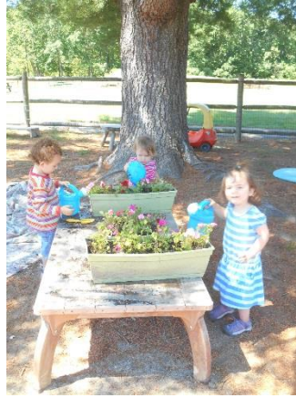
Toddlers tending their garden

Outdoor play is a key component of the summer at CCC