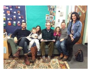
Ripley Friendship Feast