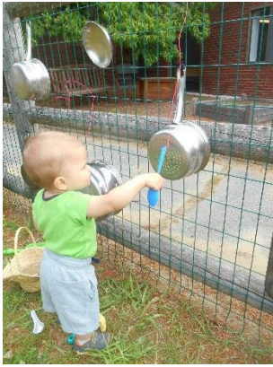
Playing with sound