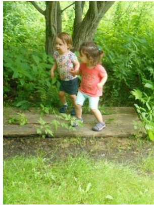
Exploration and adventure