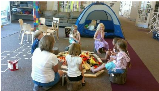
Indoor camping on a very rainy day