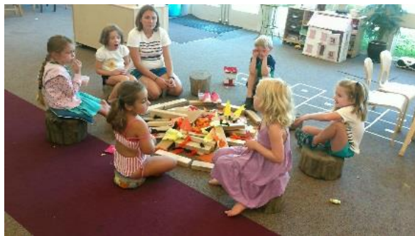
Telling stories around the campfire