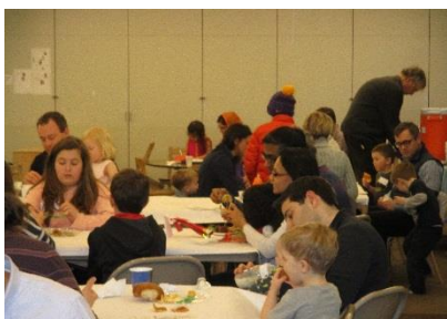
International Pot Luck

Kaymbu will add another dimension to this communication, not replace it.