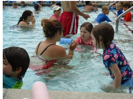
Swimming at Thoreau

Please Remember to Return Your School Forms! August 18 Deadline!