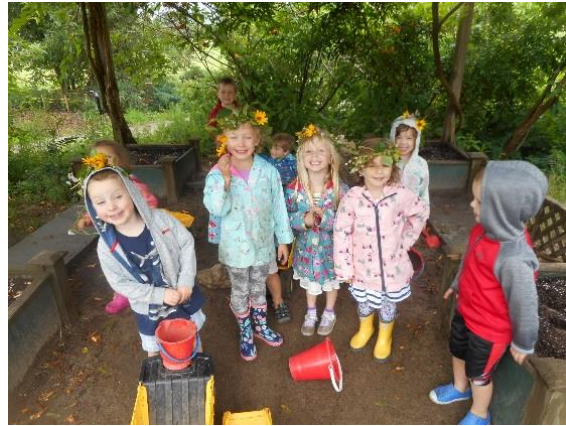
In the garden on a rainy day