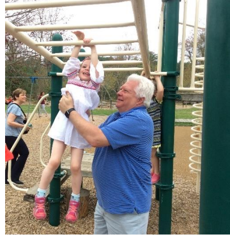
Special Friends Day is May 10!