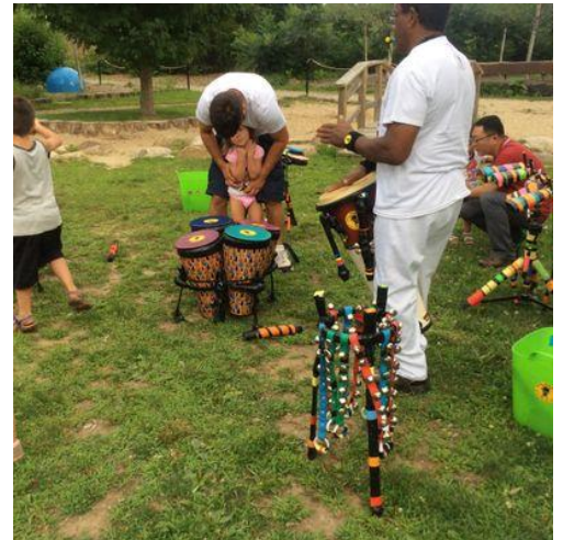
Summer Picnic with All Hands Drumming