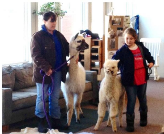
CCC Alumni visits West Concord with her Llamas