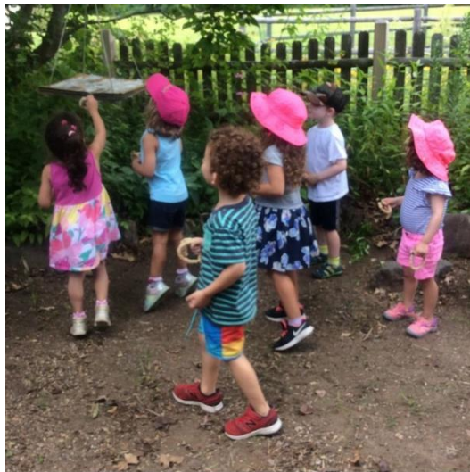
Exploring our gardens at Ripley

Please Remember to Return Your School Forms! Due date August 10 th