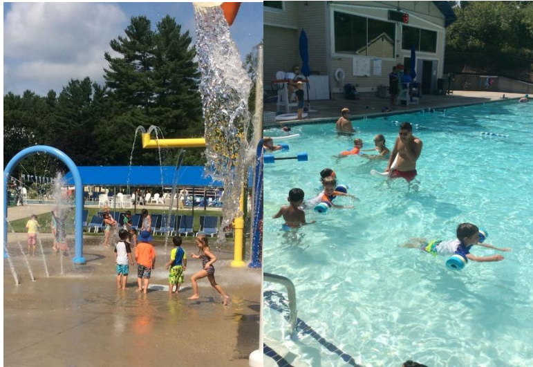
Splash Pad and Water Awareness at The Thoreau Club