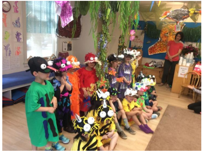
Star Room end of the year play

Bring the whole family to meet the teachers, find the cubby, check out the classrooms, meet other families, and get answers to any questions you might have!